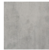
Cement Grey 03