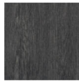
Black Ash 02

Le immagini sono fornite al solo scopo illustrativo e non costituiscono elemento contrattuale