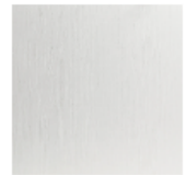
White Ash 06